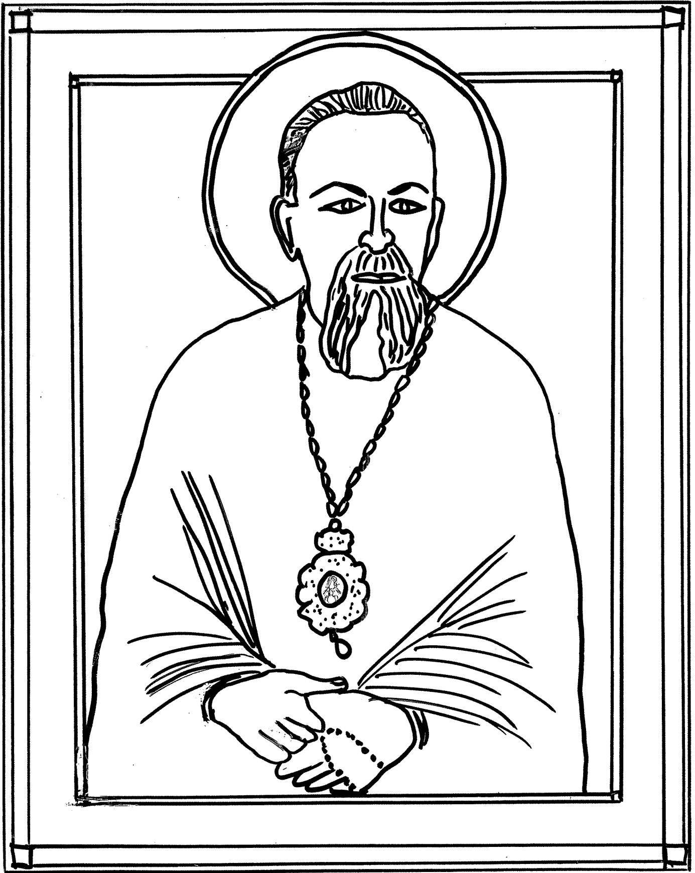
BLESSED BISHOP AND MARTYR VASYL VELYCHKOVSKY, C.Ss.R.